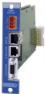
CHAS 2 ® Monitor Interface Card - Master

The Amplifier Modules, A/B Switch and Chassis, can be activated for monitoring by installing the optional CHAS -2 CONTACT CLOSURE OR WEB MONITOR Interface Card.